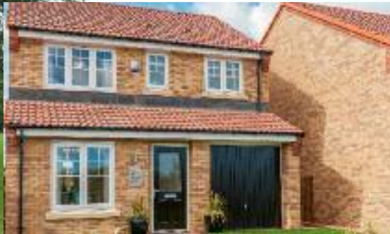
The Oval, North Luffenham

...North Luffenham Parish Council has put in an application to build 50 houses on The Oval. When consulted over 95% of you objected – but that's tough, as we're going to do it anyway.