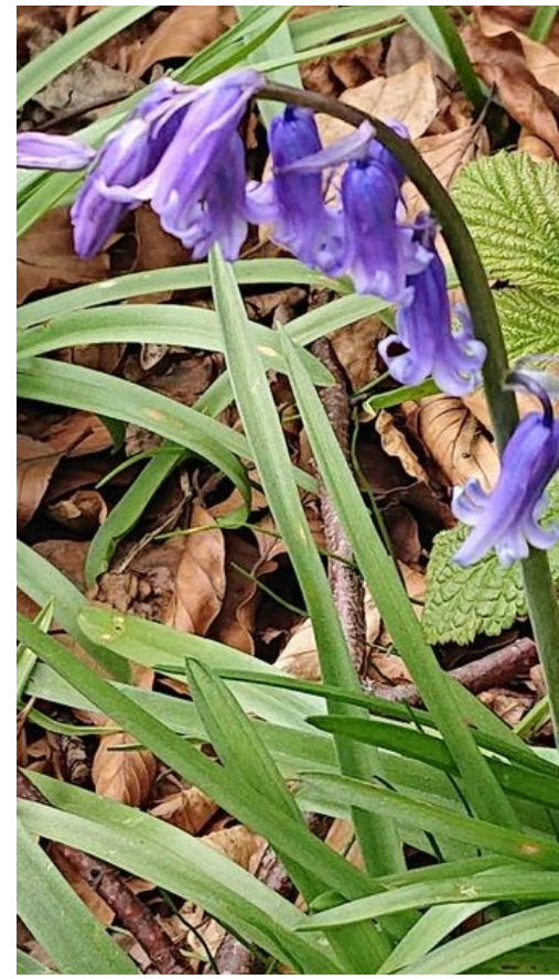
Bluebells near Whitwell with thanks to Marlen