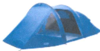
Vango Beta 450XL Tent