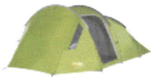
Vango Skye 400 Tent

As a result I am asking you as a Parish Council to consider our application which will be spent directly on tents to enable further adventures. We are looking at these types of tents.